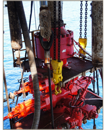
BOP - safety critical and operationally dependent upon clean fluids